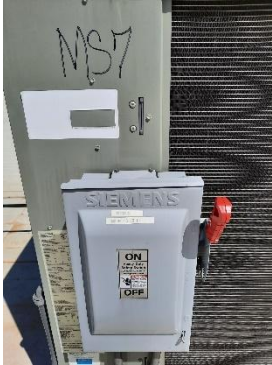
FIGURE 39 HVAC UNIT 7 SHUT OFF AT MIDDLE SCHOOL