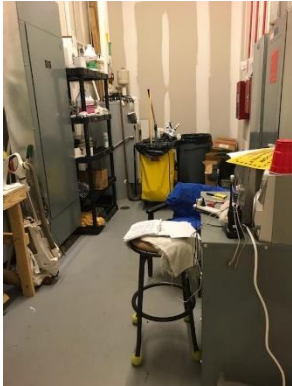
FIGURE 58 ELECTRICAL SHUT OFF 3 AT THE HIGH SCHOOL