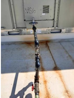
FIGURE 38 HVAC GAS UNIT 6 SHUT OFF AT MIDDLE SCHOOL