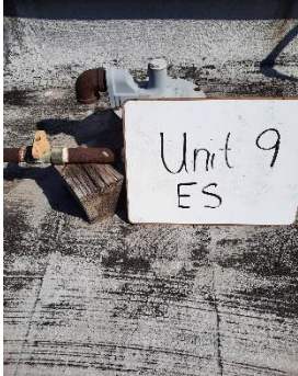
FIGURE 22 HVAC GAS SHUT OFF UNIT 9 AT ELEMENTARY SCHOOL