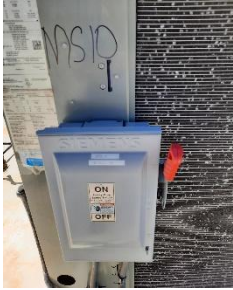
FIGURE 45 HVAC UNIT 10 SHUT OFF AT MIDDLE SCHOOL