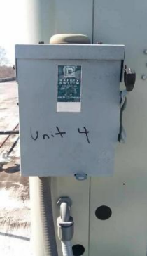
FIGURE 11 HVAC UNIT 4 SHUT OFF AT ELEMENTARY SCHOOL