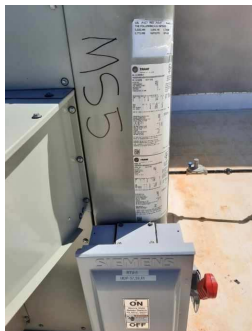
FIGURE 35 HVAC UNIT 5 SHUT OFF AT MIDDLE SCHOOL