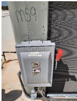
FIGURE 43 HVAC UNIT 9 SHUT OFF AT MIDDLE SCHOOL