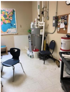
FIGURE 55 EYE WASH STATION AND ROOF ACCESS AT HIGH SCHOOL