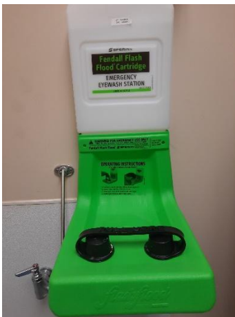
FIGURE 66 EYE WASH STATION AT CENTRAL OFFICE