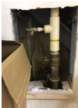
FIGURE 4 WATER SHUT OFF INSIDE AT ELEMENTARY SCHOOL