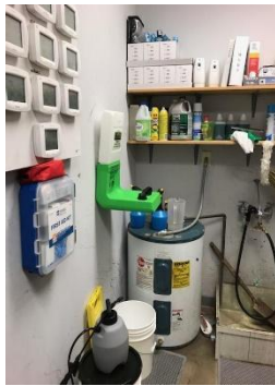
FIGURE 2 HOT WATER HEATER AND EYE WASH STATION AT ELEMENTARY SCHOOL