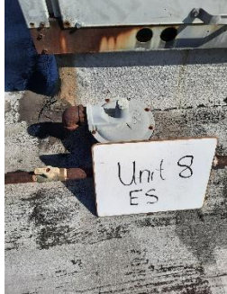
FIGURE 20 HVAC GAS SHUT OFF UNIT 8 AT ELEMENTARY SCHOOL