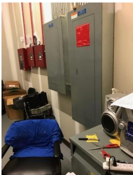
FIGURE 56 ELECTRICAL SHUT OFF 1 AT THE HIGH SCHOOL