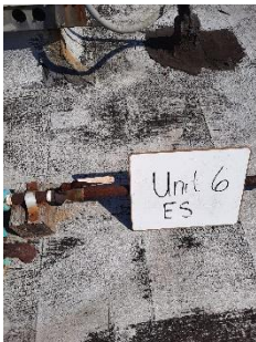
FIGURE 16 HVAC GAS SHUT OFF UNIT 6 AT ELEMENTARY SCHOOL