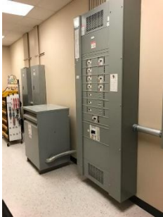
FIGURE 49 ELECTRICAL SHUT OFF AT MIDDLE SCHOOL