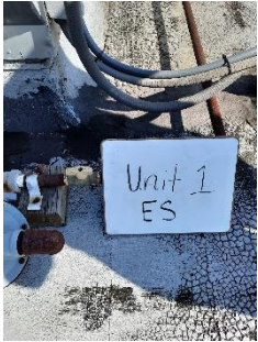
FIGURE 6 HVAC GAS SHUT OFF UNIT 1 AT ELEMENTARY SCHOOL