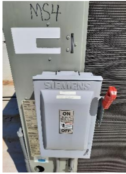
FIGURE 33 HVAC UNIT 4 SHUT OFF AT MIDDLE SCHOOL