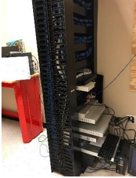
FIGURE 53 TECHNOLOGY ROOM 2 AT THE MIDDLE SCHOOL