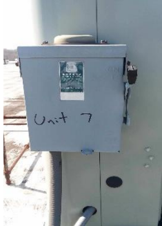
FIGURE 17 HVAC UNIT 7 SHUT OFF AT ELEMENTARY SCHOOL