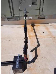
FIGURE 46 HVAC GAS UNIT 10 SHUT OFF AT MIDDLE SCHOOL