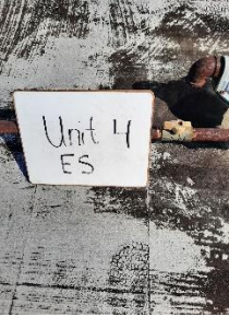
FIGURE 12 HVAC GAS SHUT OFF UNIT 4 AT ELEMENTARY SCHOOL