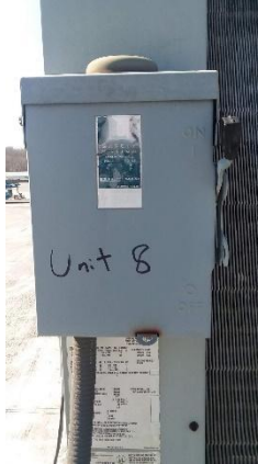
FIGURE 19 HVAC UNIT 8 SHUT OFF AT ELEMENTARY SCHOOL