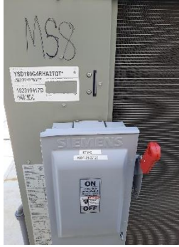
FIGURE 41 HVAC UNIT 8 SHUT OFF AT MIDDLE SCHOOL