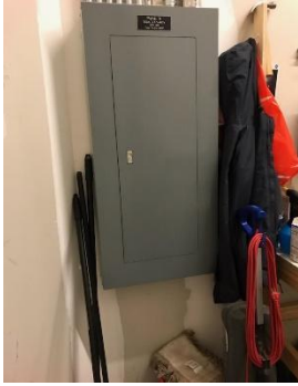
FIGURE 57 ELECTRICAL SHUT OFF 2 AT THE HIGH SCHOOL