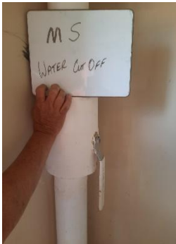
FIGURE 54 WATER SHUT OFF AT THE MIDDLE SCHOOL