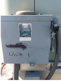
FIGURE 5 HVAC UNIT 1 SHUT OFF AT ELEMENTARY SCHOOL