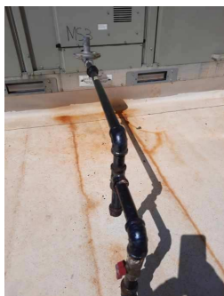
FIGURE 32 HVAC GAS UNIT 3 SHUT OFF AT MIDDLE SCHOOL