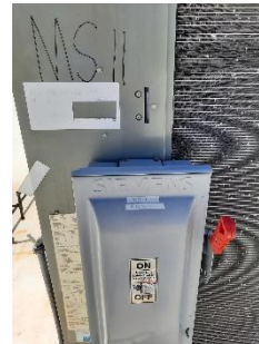
FIGURE 47 HVAC UNIT 11 SHUT OFF AT MIDDLE SCHOOL