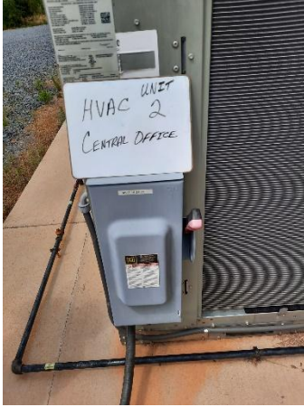
FIGURE 64 HVAC 2 AT CENTRAL OFFICE