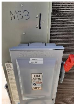
FIGURE 31 HVAC UNIT 3 SHUT OFF AT MIDDLE SCHOOL