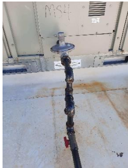
FIGURE 34 HVAC GAS UNIT 4 SHUT OFF AT MIDDLE SCHOOL