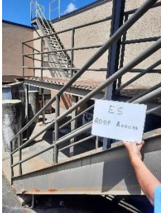
FIGURE 25 ROOF ACCESS AT THE ELEMENTARY SCHOOL