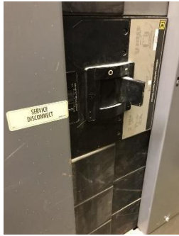
FIGURE 1 ELECTRICAL SHUT OFF AT ELEMENTARY SCHOOL