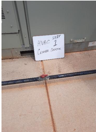
FIGURE 62 HVAC 1 GAS SHUT OFF AT CENTRAL OFFICE