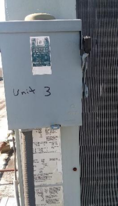
FIGURE 9 HVAC UNIT 3 SHUT OFF AT ELEMENTARY SCHOOL