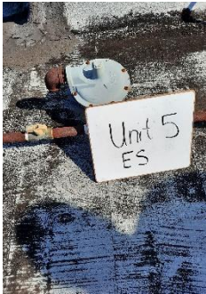
FIGURE 14 HVAC GAS SHUT OFF UNIT 5 AT ELEMENTARY SCHOOL