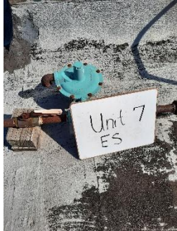
FIGURE 18 HVAC GAS SHUT OFF UNIT 7 AT ELEMENTARY SCHOOL