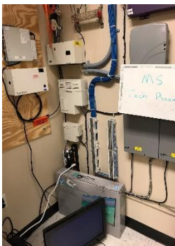
FIGURE 52 TECHNOLOGY ROOM 1 AT THE MIDDLE SCHOOL