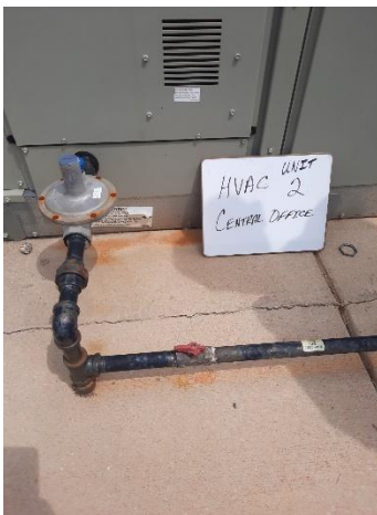
FIGURE 65 HVAC 2 GAS SHUT OFF AT CENTRAL OFFICE