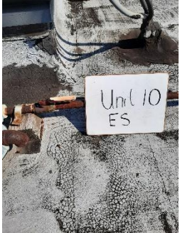
FIGURE 24 HVAC GAS SHUT OFF UNIT 10 AT ELEMENTARY SCHOOL