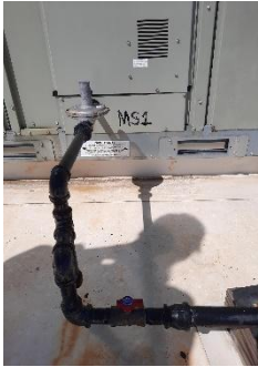
FIGURE 28 HVAC GAS UNIT 1 SHUT OFF AT MIDDLE SCHOOL