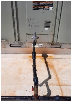
FIGURE 48 HVAC GAS UNIT 11 SHUT OFF AT MIDDLE SCHOOL