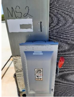
FIGURE 29 HVAC UNIT 2 SHUT OFF AT MIDDLE SCHOOL