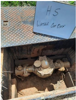
FIGURE 60 WATER SHUT OFF AT THE HIGH SCHOOL