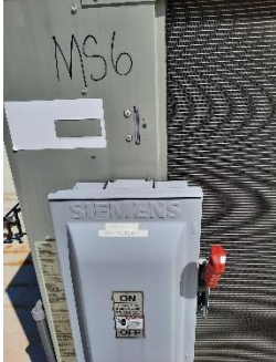
FIGURE 37 HVAC UNIT 6 SHUT OFF AT MIDDLE SCHOOL