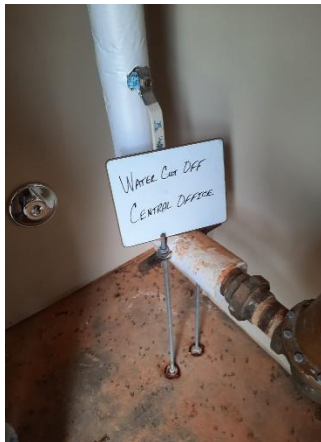
FIGURE 63 WATER SHUT OFF AT CENTRAL OFFICE