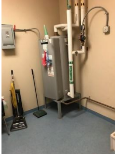
FIGURE 50 HOT WATER HEATER SHUT OFF AT MIDDLE SCHOOL