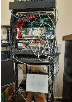
FIGURE 26 TECH ROOM AT ELEMENTARY SCHOOL