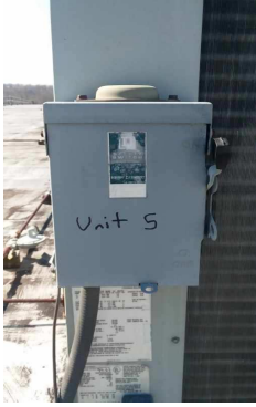
FIGURE 13 HVAC UNIT 5 SHUT OFF AT ELEMENTARY SCHOOL