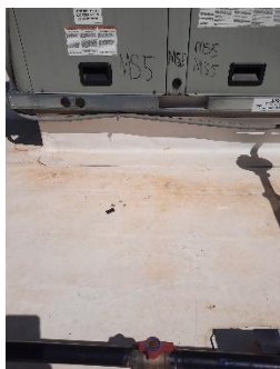
FIGURE 36 HVAC GAS UNIT 5 SHUT OFF AT MIDDLE SCHOOL