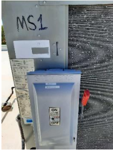
FIGURE 27 HVAC UNIT 1 SHUT OFF AT MIDDLE SCHOOL