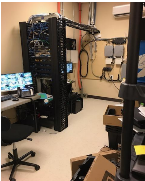
FIGURE 59 TECHNOLOGY ROOM AT THE HIGH SCHOOL