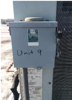
FIGURE 21 HVAC UNIT 9 SHUT OFF AT ELEMENTARY SCHOOL