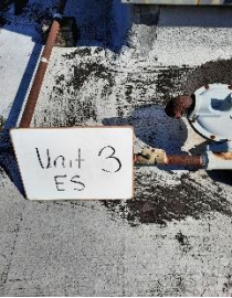
FIGURE 10 HVAC GAS SHUT OFF UNIT 3 AT ELEMENTARY SCHOOL