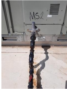
FIGURE 30 HVAC GAS UNIT 2 SHUT OFF AT MIDDLE SCHOOL