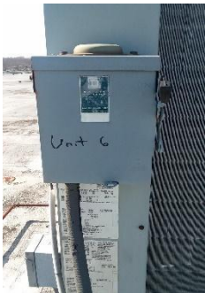
FIGURE 15 HVAC UNIT 6 SHUT OFF AT ELEMENTARY SCHOOL