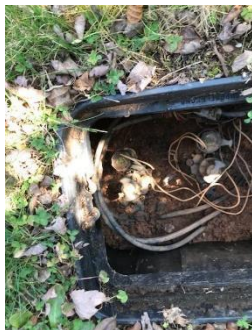
FIGURE 3 WATER SHUT OFF AT ROAD AT ELEMENTARY SCHOOL