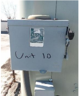
FIGURE 23 HVAC UNIT 10 SHUT OFF AT ELEMENTARY SCHOOL