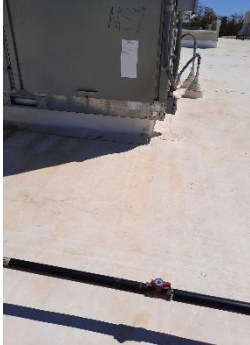
FIGURE 40 HVAC GAS UNIT 7 SHUT OFF AT MIDDLE SCHOOL