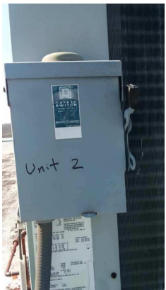
FIGURE 7 HVAC UNIT 2 SHUT OFF AT ELEMENTARY SCHOOL