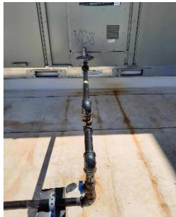
FIGURE 42 HVAC GAS UNIT 8 SHUT OFF AT MIDDLE SCHOOL