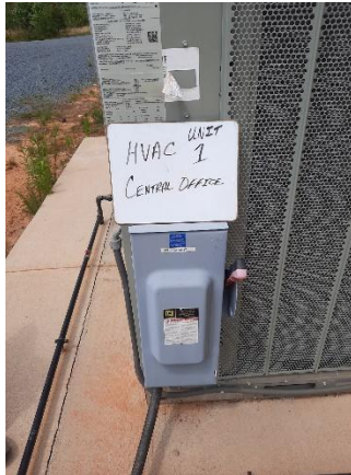
FIGURE 61 HVAC 1 AT THE CENTRAL OFFICE