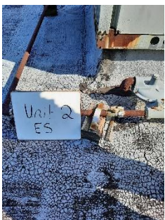
FIGURE 8 HVAC GAS SHUT OFF UNIT 2 AT ELEMENTARY SCHOOL