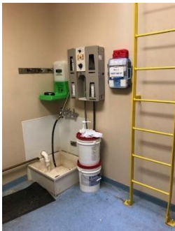
FIGURE 51 EYE WASH STATION AND ROOF ACCESS AT MIDDLE SCHOOL