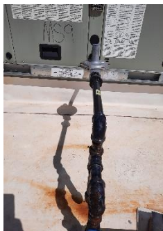
FIGURE 44 HVAC GAS UNIT 9 SHUT OFF AT MIDDLE SCHOOL